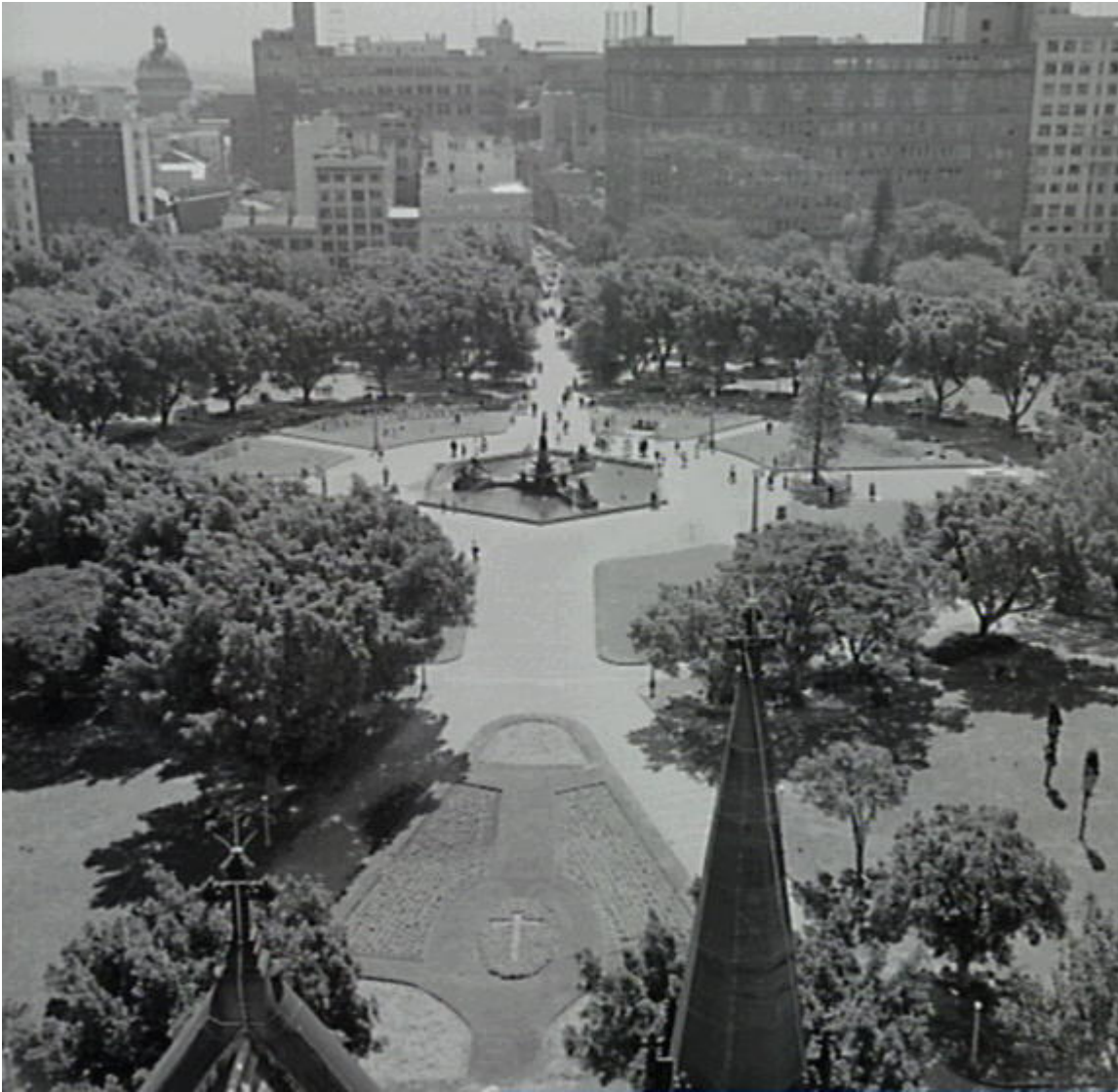
Image a) Archibald Fountain 1962 Fig trees surround the fountain.